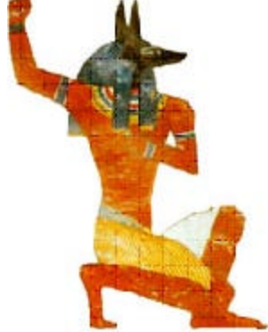
Anubis with Praise Mudra

3) The Praise Mudra. The members of the Egyptian Mystery Schools were well versed in the meaning and art of praising their gods. The temple hierophants knew that the secret effects of praises were upon the person giving the praise rather than the god receiving it. About two thousand years ago we were told to love our enemies by an Initiate of the Egyptian Mystery School. Why? Because love ennobles us. It does not matter if another deserves our love or not. The act of loving unfolds our divine nature and causes a greater force of our Higher Self to indwell in the physical form. The same