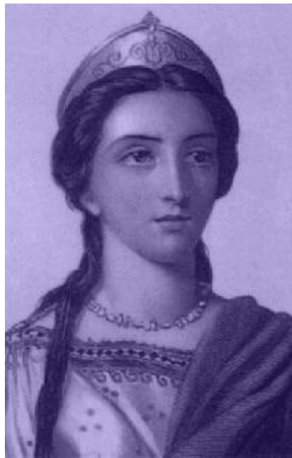
Portia, the Goddess of Justice--"Ratu Adil."

R. Ng Ranggawarsita, a poet of the "Kraton Surakarta" once wrote that a king would be born in Mecca with symbolic signs appearing such as the "Tujung Putih, Pudak Sinumpet," or "White Lotus Flower, Hidden Bud." The White Lotus Flower supposedly refers to Ratu Adil, whereas the Hidden Bud refers to Satria Piningit.